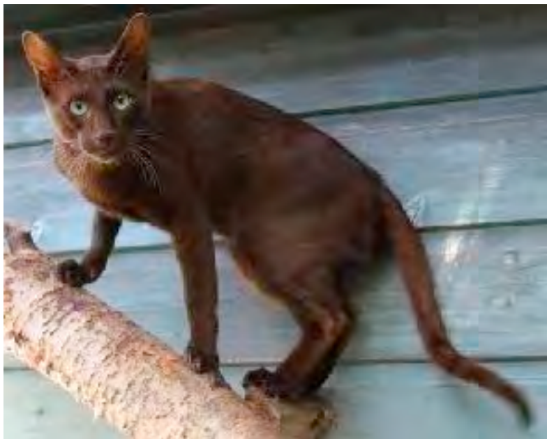
Eastpoint Brexit Boris - part of the outcross programme