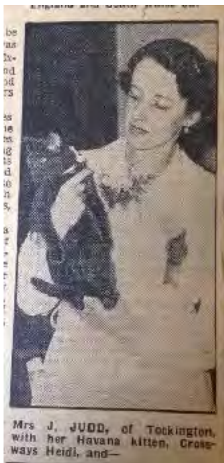
The Western Daily Press & Bristol Mirror Thursday 26th September 1957