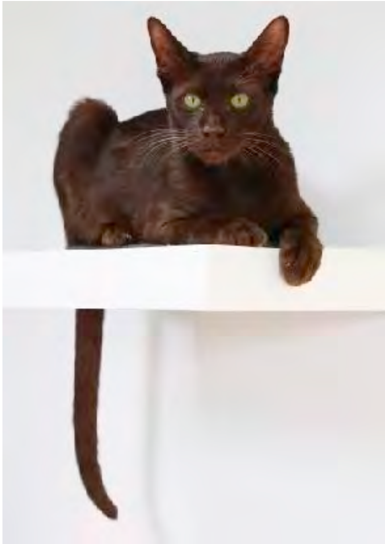
Eastpoint Kalon Karobin