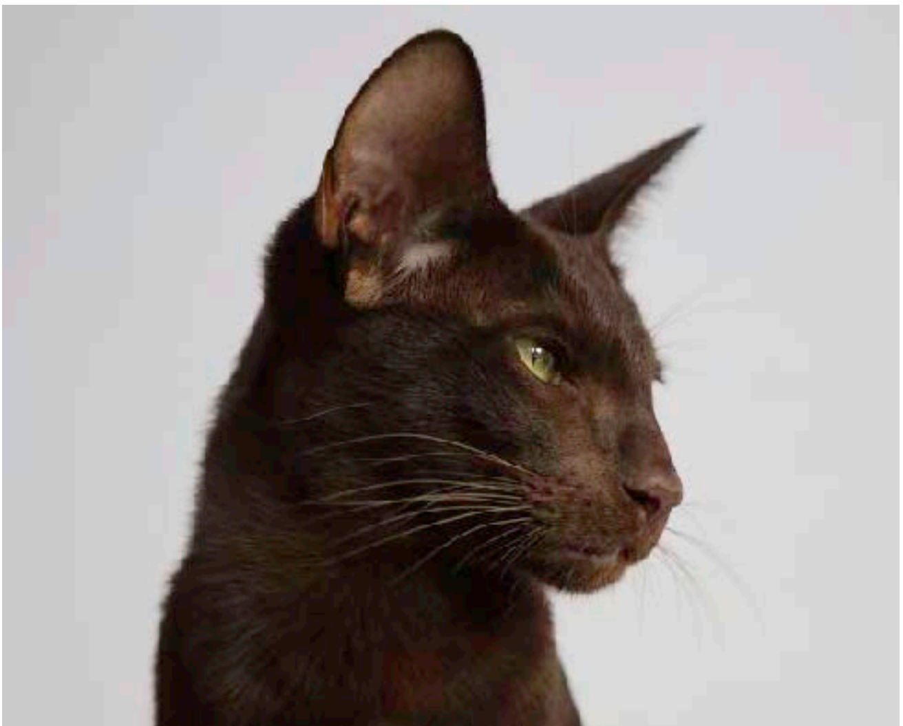
Eastpoint Soigné Sorrel